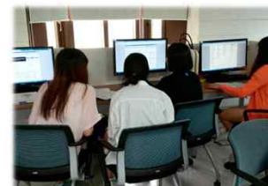
▪ Computer-Based Learning