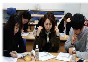
▪ Problem-Based Learning